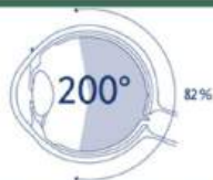
with optomap ultra-widefield retinal imaging

Introducing the New optomap ultra-wide field retinal imaging technology, giving us a comprehensive view of your eye health